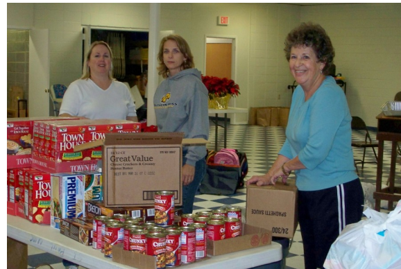
St. Paul members pack extra food for long holiday breaks such as Thanksgiving, Christmas, and Spring Break and Easter.

When the children of Ocean Springs returned to school in October of 2005, it became apparent that the need in our community had changed. We identified over 50 children in need for our assistance. As the school year progressed teachers and counselors began to identify more and we served as many as 100 children during the first school year following Katrina.