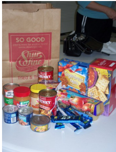
A sample of some of the foods we are providing.

Backpack Buddies is a local mission of St. Paul United Methodist Church, Ocean Springs, Mississippi. We provide backpacks full of food for hungry children in the Ocean Springs School District. We pack foods for breakfast, lunch and dinner meals as well as snacks to sustain a child for the weekend. Our goal is to fill the gap from Friday to Monday for school-aged children who receive free breakfast and lunch at school, but are not getting adequate nutrition on the weekends. We feed the siblings of the identified child as well. We work closely with school counselors who identify the children and coordinate their enrollment in the program. To protect the privacy of the individual families, we do not know the names of participants in our program only the number of children served. We are currently feeding 80 children.